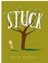
Stuck Oliver Jeffers